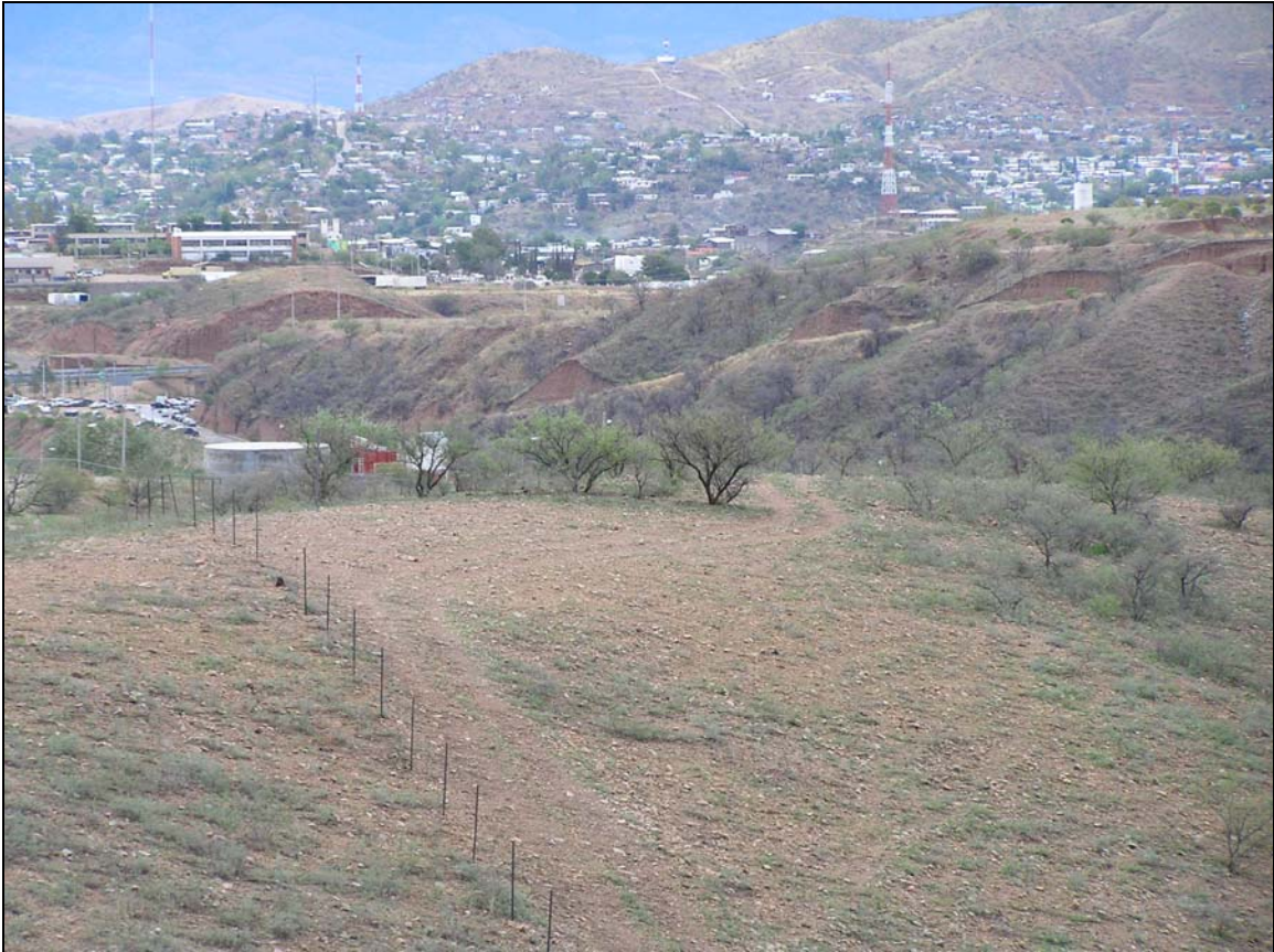
U.S.-Mexico border in Arizona

In addition to Federal agents, State and local law enforcement also patrol the border areas. In remote areas along the border, many sheriffs' departments are called upon to address border-related criminal matters and serve as a backstop to CBP operations. In many cases, these local law enforcement agencies do not have the resources necessary to patrol the thousands of square miles of border territory under their respective jurisdiction, leaving the security of the border vulnerable.