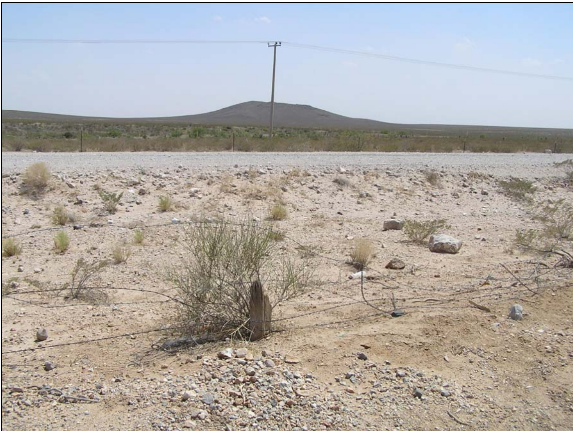
U.S.-Mexico border in New Mexico

The United States border with Mexico extends nearly 2,000 miles along the southern borders of California, Arizona, New Mexico and Texas. In most areas, the border is located in remote and sparsely populated areas of vast desert and rugged mountain terrain.